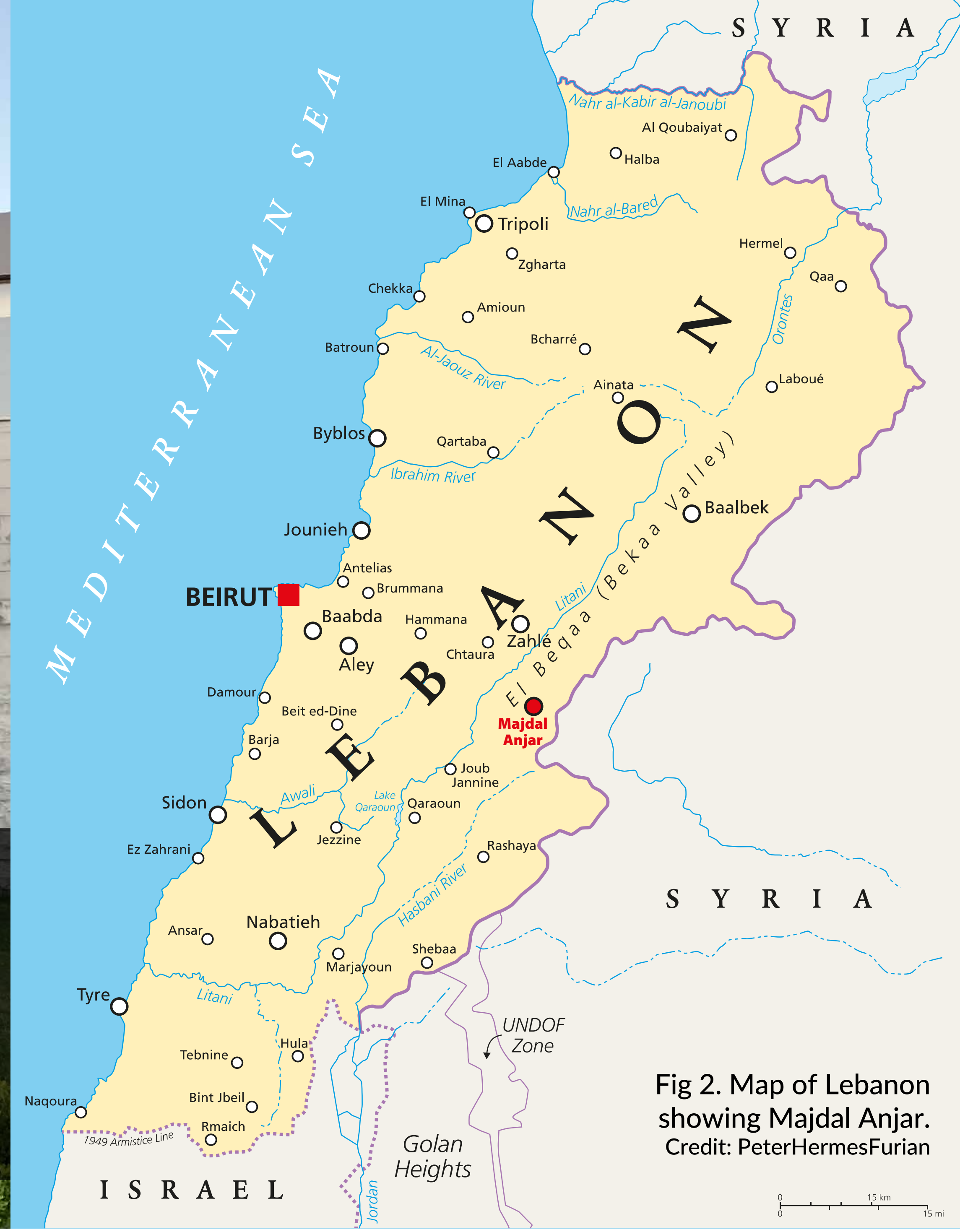
Fig 2. Map of Lebanon showing Majdal Anjar.

This poster discusses the establishment and impact of a pilot program to manage local healthcare governance within a Municipal Health Committee (MHC) in Majdal Anjar, Lebanon.